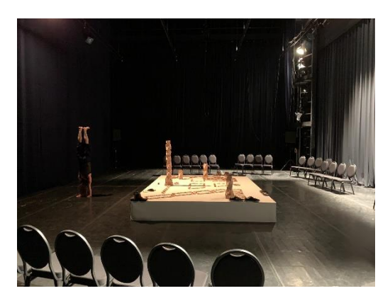
Example of the Bird's Eye view