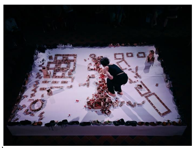
Scène-sur-scène (With 3m distance audience - stage)