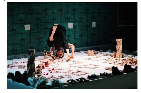
A commune Hall